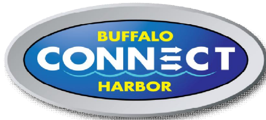
Figure 3 – Project Logo

5.4.1. Project Branding – Project branding has been developed and will continue to be utilized to give this project a unique identification throughout the community. A project logo has been developed for this purpose as shown below in Figure 3. This logo will be used on the project website, project advertisements, project correspondence, reports, handouts and graphics.